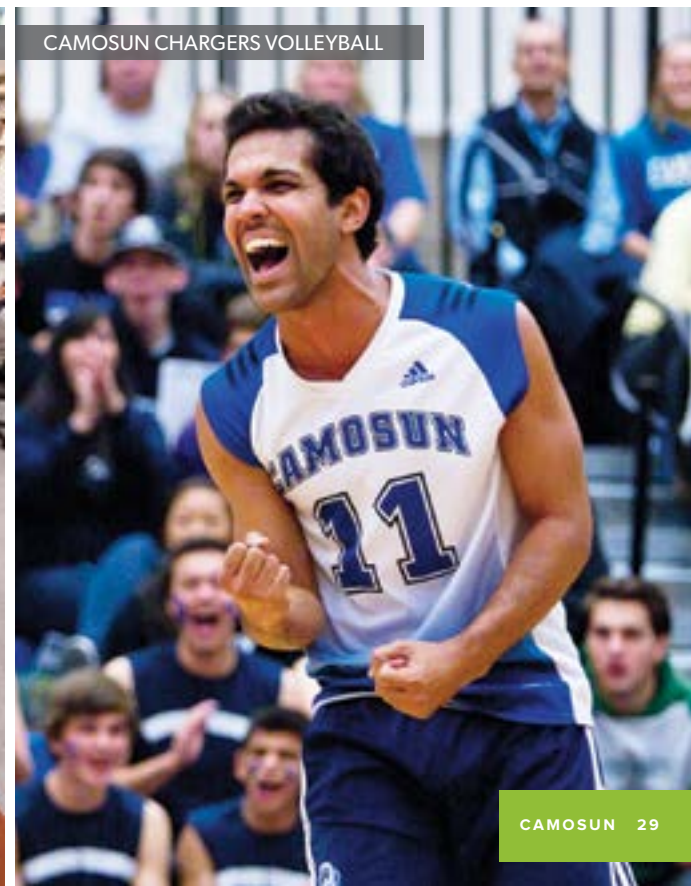
CAMOSUN CHARGERS VOLLEYBALL