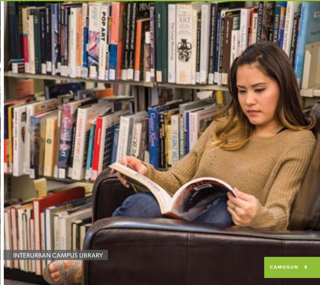
INTERURBAN CAMPUS LIBRARY