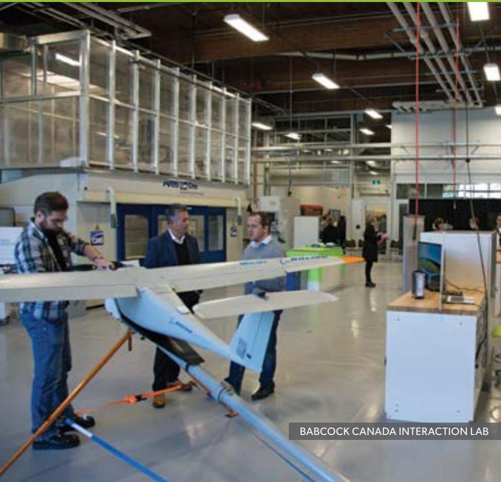
BABCOCK CANADA INTERACTION LAB